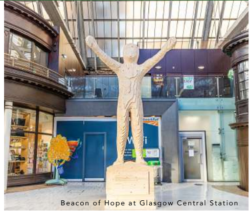
Beacon of Hope at Glasgow Central Station