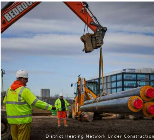
District Heating Network Under Construction

Initially 48 homes and Clyde Gateway's new low carbon EastWorks offices will be connected to the district heating network, with plans to connect over 300 homes and commercial businesses over the coming years.