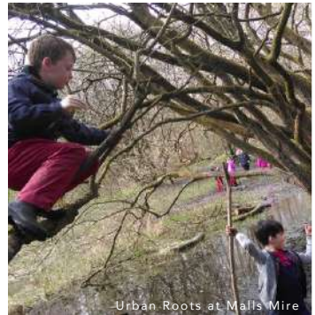
Urban Roots at Malls Mire