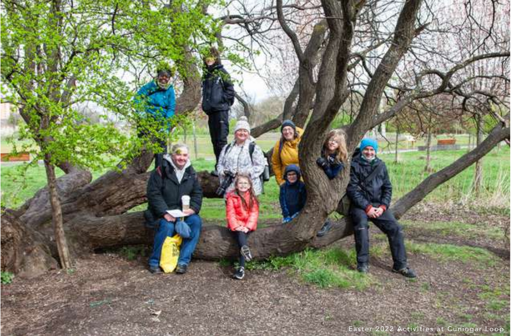
Easter 2022 Activities at Cuningar Loop