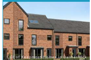
CGI of Keepmoat Homes in Dalmarnock

Each home will connect to the new Dalmarnock district heating network (DHN) and have enhanced insulation and solar PV panels so that energy bills will be as low as possible for residents.