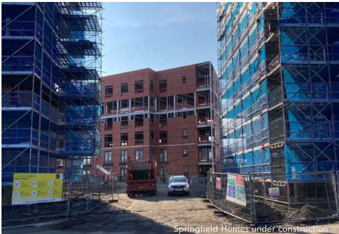
Springfield Homes under construction

Clyde Gateway continues to meet the growing demand for new houses in the area, delivering quality homes for the local community and attracting more and more people who recognise the East End as a desirable place to live, in part because of its good transport links, quick access to the city centre and first-class green spaces.