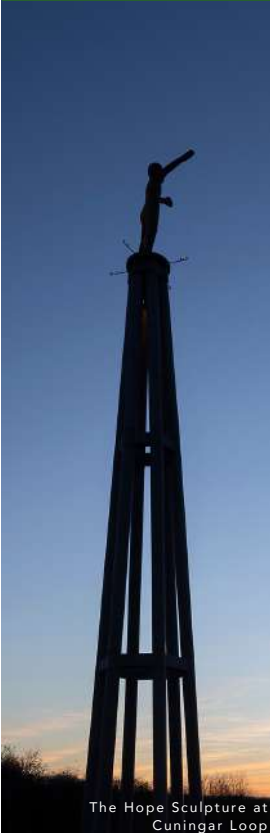
The Hope Sculpture at Cuningar Loop