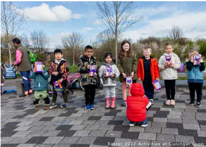
Easter 2022 Activities at Cuningar Loop