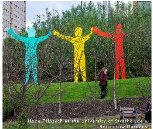
Hope Triptych at the University of Strathclyde's Rottenrow Gardens